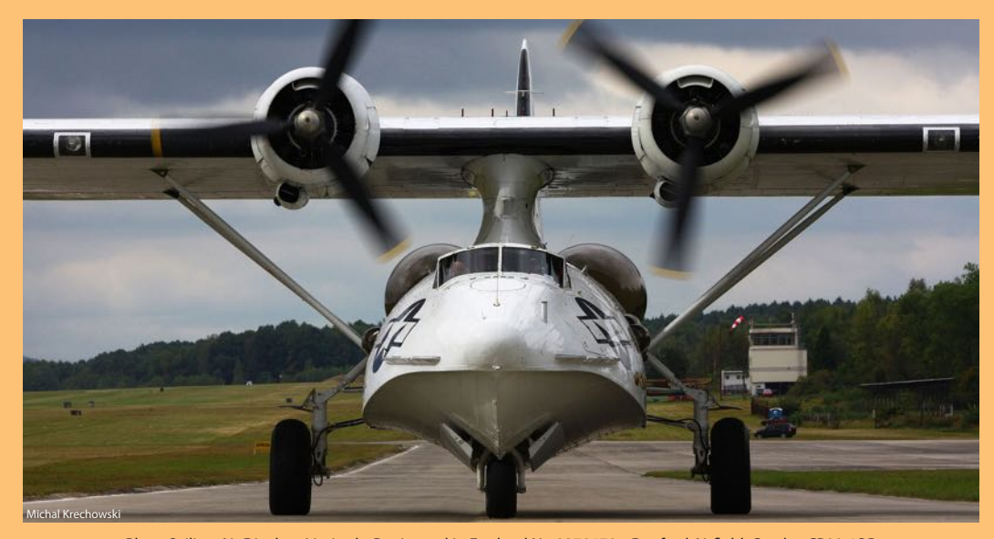
Plane Sailing Air Displays Limited. Registered in England No 2378479. Duxford Airfield, Cambs CB22 4QR

During the afternoon, there may be the chance for some / all of those attending to make a short flight in the Catalina, depending upon circumstances. Any such flying will be free of charge.